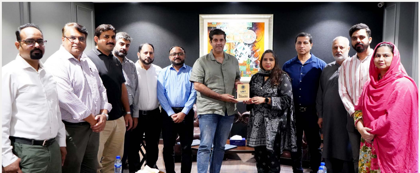
MoU with Hustle and Hola