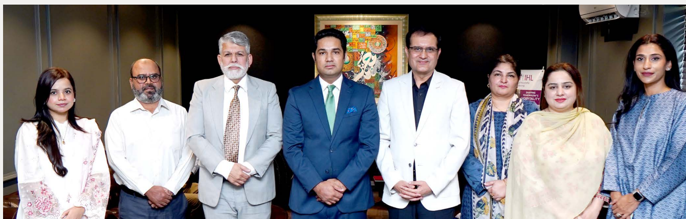
MoU With Western Premium Hotel