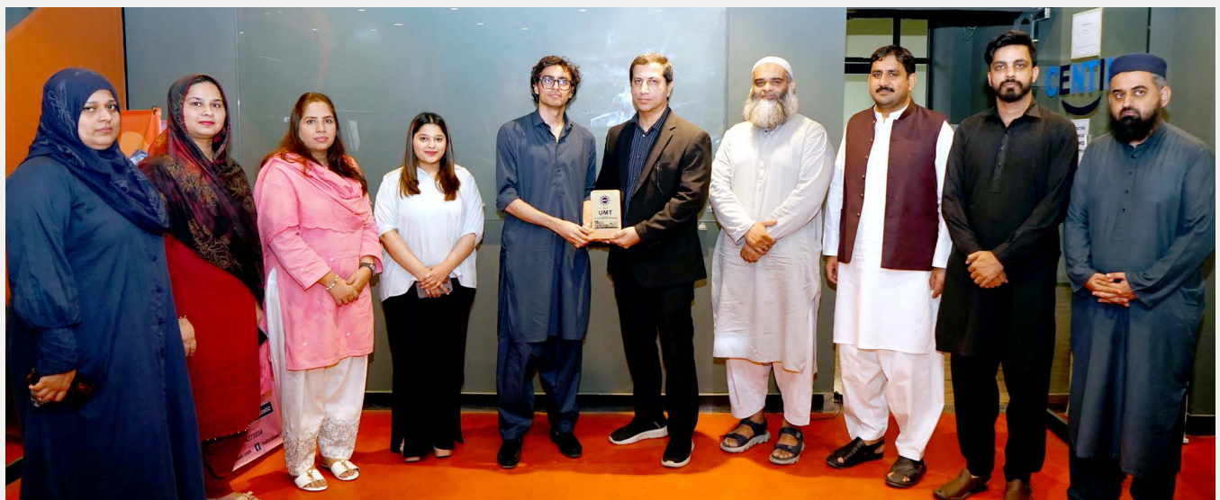
MoU with Vanar chain