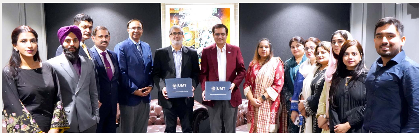
MoU with Fletti's Hotel